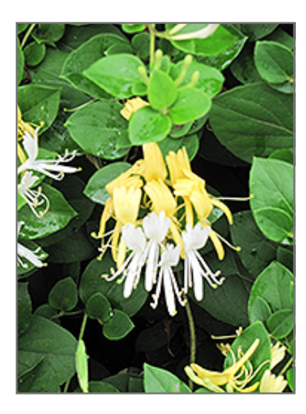
Hall's Japanese Honeysuckle flowers