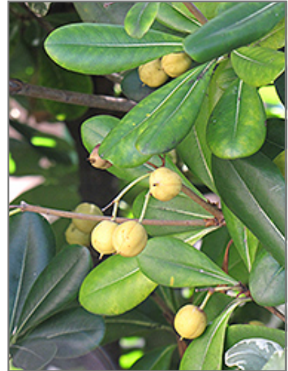
Wheeler's Dwarf Pittosporum fruit

This shrub does best in full sun to partial shade. It does best in average to evenly moist conditions, but will not tolerate standing water. It may require supplemental watering during periods of drought or extended heat. It is not particular as to soil type or pH. It is somewhat tolerant of urban pollution. This is a selected variety of a species not originally from North America.