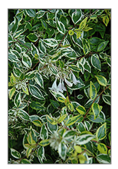
Hopley's Abelia flowers

2974 Johnston St., Lafayette, LA 70503 (337) 264-1418 buyallseasons.com