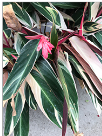
Tricolor Stromanthe flowers

This plant does best in full sun to partial shade. It prefers to grow in average to moist conditions, and shouldn't be allowed to dry out. It may require supplemental watering during periods of drought or extended heat. It is not particular as to soil pH, but grows best in rich soils. It is somewhat tolerant of urban pollution. This is a selected variety of a species not originally from North America. It can be propagated by division; however, as a cultivated variety, be aware that it may be subject to certain restrictions or prohibitions on propagation.