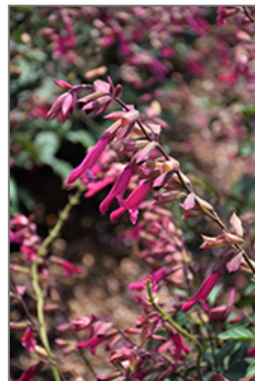
Wendy's Wish Sage flowers

Wendy's Wish Sage is recommended for the following landscape applications;