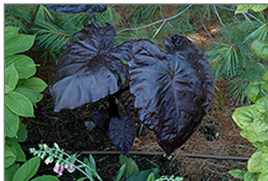
Royal Hawaiian Black Coral Elephant Ear