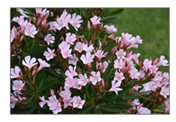
Petite Pink Oleander flowers

Petite Pink Oleander is recommended for the following landscape applications;