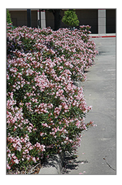
Petite Pink Oleander in bloom

This shrub does best in full sun to partial shade. It is very adaptable to both dry and moist locations, and should do just fine under average home landscape conditions. It is considered to be drought-tolerant, and thus makes an ideal choice for xeriscaping or the moisture-conserving landscape. It is not particular as to soil pH, but grows best in poor soils, and is able to handle environmental salt. It is highly tolerant of urban pollution and will even thrive in inner city environments. This is a selected variety of a species not originally from North America, and parts of it are known to be toxic to humans and animals, so care should be exercised in planting it around children and pets.