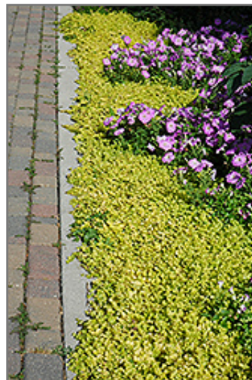
Golden Creeping Jenny