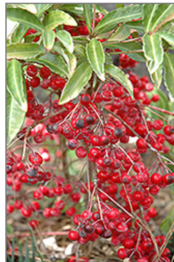
Christmas Berry Ardisia fruit