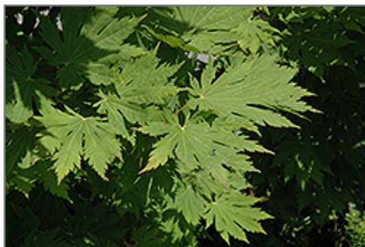
Rising Sun Fullmoon Maple foliage