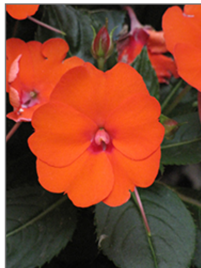
SunPatiens Compact Electric Orange New Guinea Impatiens flowers

This plant will require occasional maintenance and upkeep, and should not require much pruning, except when necessary, such as to remove dieback. It is a good choice for attracting bees and butterflies to your yard. It has no significant negative characteristics.