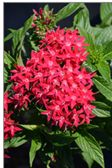
Graffiti Lipstick Star Flower flowers

Graffiti Lipstick Star Flower is recommended for the following landscape applications;