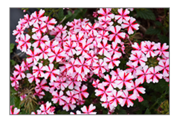
Lanai Candy Cane Verbena flowers