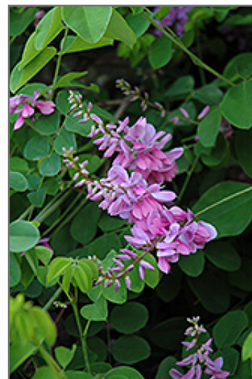
Chinese Indigo flowers