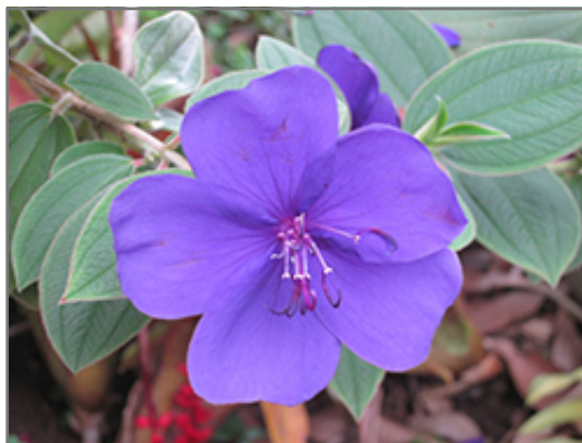
Princess Flower flowers

Princess Flower is recommended for the following landscape applications;