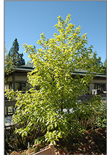
Chinese Parasol Tree