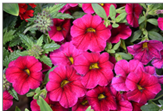
Superbells Cherry Red Calibrachoa flowers