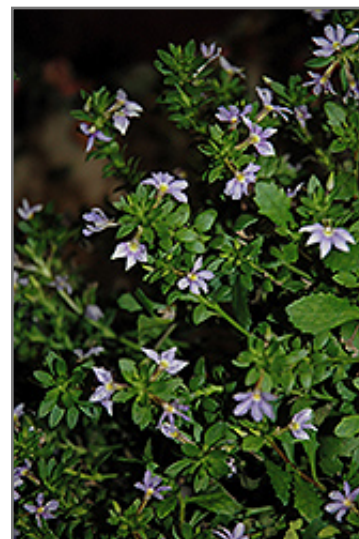
Cajun Blue Fan Flower flowers

Cajun Blue Fan Flower will grow to be about 10 inches tall at maturity, with a spread of 10 inches. When grown in masses or used as a bedding plant, individual plants should be spaced approximately 8 inches apart. Its foliage tends to remain low and dense right to the ground. It grows at a fast rate, and under ideal conditions can be expected to live for approximately 5 years. As an herbaceous perennial, this plant will usually die back to the crown each winter, and will regrow from the base each spring. Be careful not to disturb the crown in late winter when it may not be readily seen!