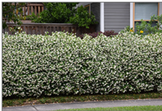
Confederate Star-Jasmine in bloom