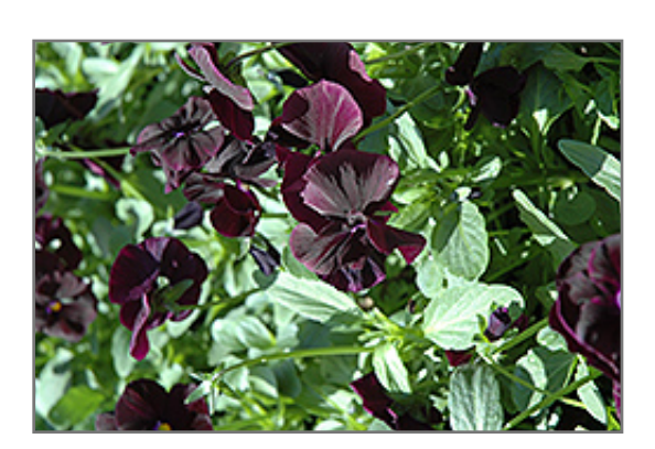
Sorbet XP Blackberry Pansy flowers