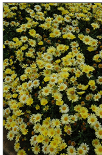
Butterfly Marguerite Daisy flowers