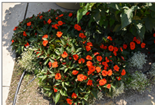
SunPatiens Compact Orange New Guinea Impatiens in bloom

SunPatiens Compact Orange New Guinea Impatiens will grow to be about 24 inches tall at maturity, with a spread of 24 inches. When grown in masses or used as a bedding plant, individual plants should be spaced approximately 20 inches apart. Its foliage tends to remain dense right to the ground, not requiring facer plants in front. This fast-growing annual will normally live for one full growing season, needing replacement the following year.