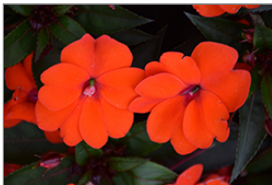
SunPatiens Compact Orange New Guinea Impatiens flowers

This plant will require occasional maintenance and upkeep, and should not require much pruning, except when necessary, such as to remove dieback. It is a good choice for attracting bees and butterflies to your yard. It has no significant negative characteristics.