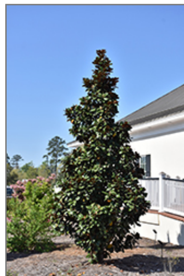
Teddy Bear Magnolia