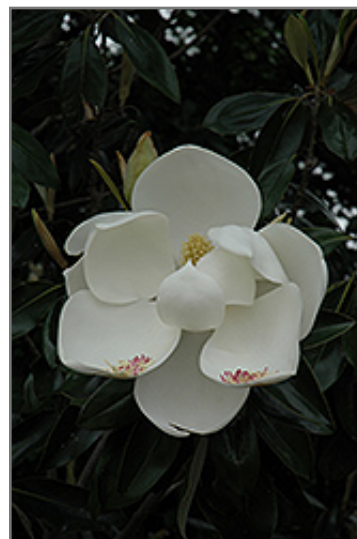
Teddy Bear Magnolia flowers