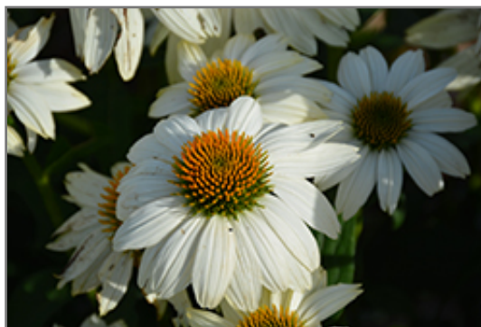
PowWow White Coneflower flowers

This is a relatively low maintenance plant, and is best cleaned up in early spring before it resumes active growth for the season. It is a good choice for attracting birds and butterflies to your yard, but is not particularly attractive to deer who tend to leave it alone in favor of tastier treats. It has no significant negative characteristics.