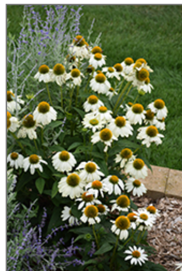
PowWow White Coneflower in bloom