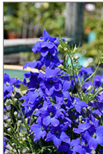
Diamonds Blue Delphinium flowers