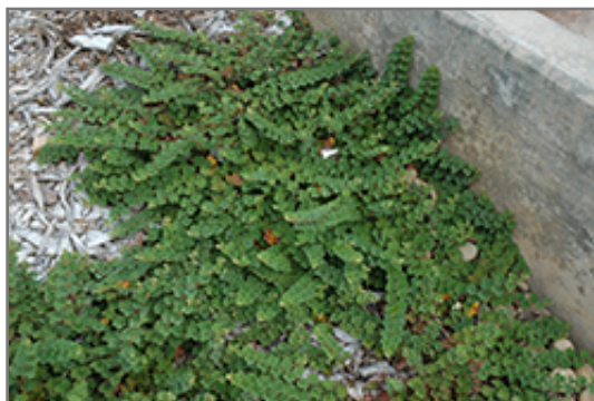
Emerald Carpet Raspberry